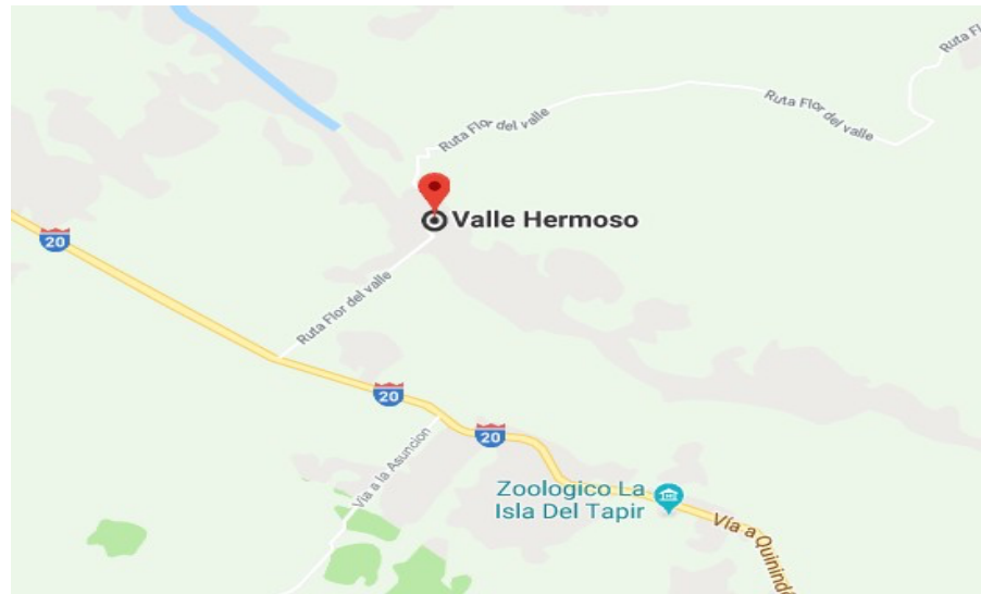
Figure 1: Representation of the location of the parish of Valle Hermoso: Northwest Central Ecuador.